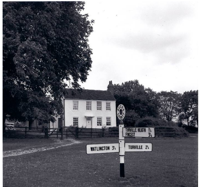
The White House, Northend, 1939, E. McKnight Kauffer